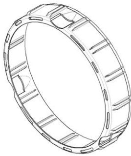
Figure 3: ZW700B-9060 Spacer Ring